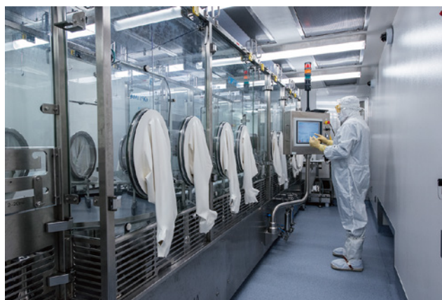
■ Sterile production area for the fill and finish of drug products

Aji Bio-Pharma has a range of capabilities and facilities around the world. Their facilities in Belgium, Japan, and India focus on conventional "small molecule" production, bringing some of the most needed conventional medicines to millions of people in need throughout the world. The specific focus in the California, USA facilities is on "large molecule" biologic medicines, and its Osaka, Japan facilities focus on gene expression technologies.